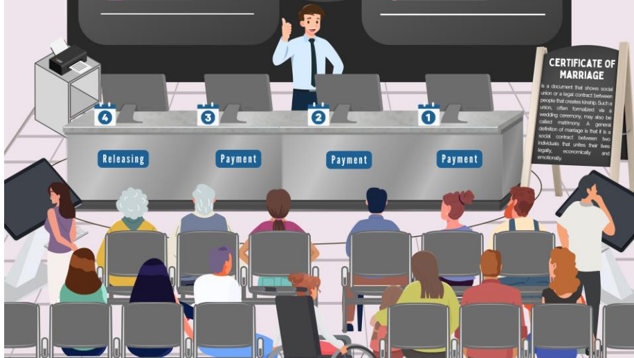
Source: Month-to-Date Volume of Transactions by Transaction Type, CRS Zamboanga City Serbilis Outlet

PHILIPPINE STATISTICS AUTHORITY Region IX- Zamboanga Peninsula