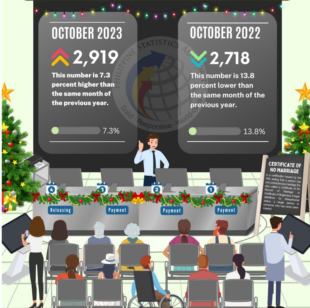
Source: Month-to-Date Volume of Transactions by Transaction Type, CRS Zamboanga City Serbilis Outlet

PHILIPPINE STATISTICS AUTHORITY Region IX- Zamboanga Peninsula