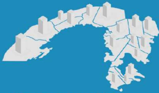
MAP OF ZAMBOANGA SIBUGAY