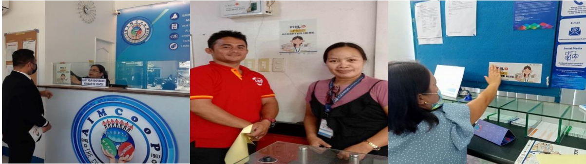
A sticker posted at AIMCOOP, Sergio Osmeña, Zamboanaa del Norte

Date of Release: August 10, 2023 Reference No. 2023-PSA-ZDN-010