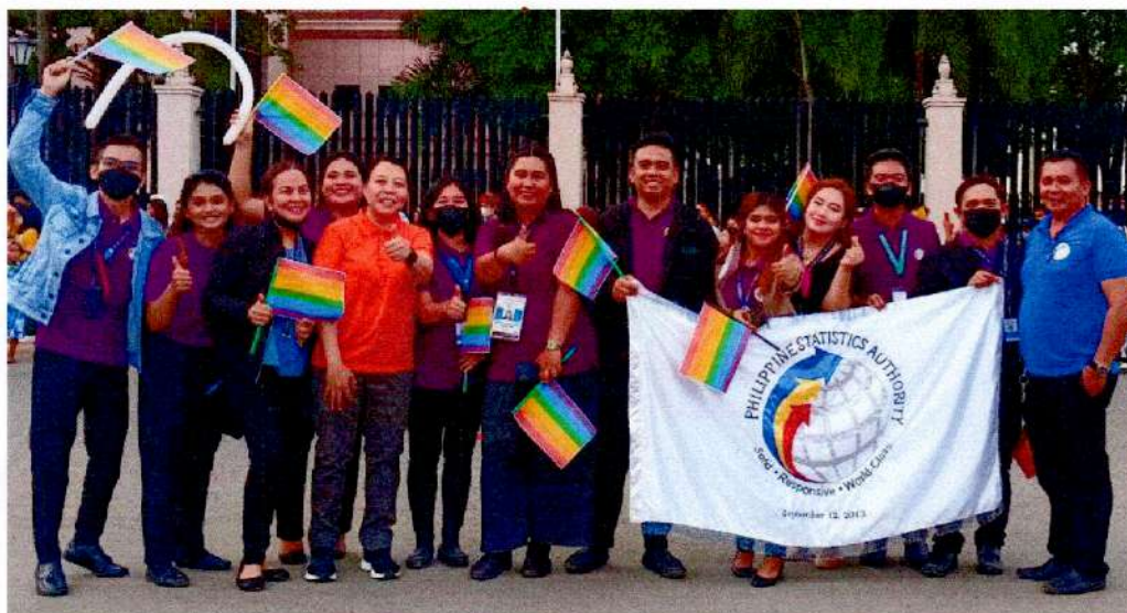
Photo opportunity of Philippine Statistics Authority IX employees together with Vice Mayor Josephine “Pinpin” Pareja of Zamboanga city, during the Pride Parade.

The Philippine Statistics Authority - Regional Statistical Services Office IX (PSA - RSSO IX) joined the annual Pride Parade by the City Government of Zamboanga through the office of Gender and Development of the City Mayor, in coordination with the Mujer LGBT Organization Inc. last 29 th of June 2023 with the theme: “Diversity, Equality and Inclusivity”. The pride parade tagged as “Orgullo 2023”, gives the LGBTQIA+ community to celebrate and the opportunity to conduct a peaceful march and raise awareness of the current issues they confront on gender equality.