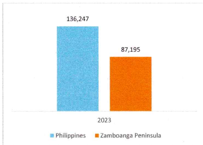
Figure 2. Philippines and Zamboanga Peninsula, Per Capita Household Final Consumption Expenditure: 2023 At Constant 2018 Prices, in pesos

The per capita HFCE of Zamboanga Peninsula grew by 2.1 percent in 2023. It was estimated at PhP 87,195 in 2023, lower than the national level which amounted to PhP 136,247. (Figure 2)