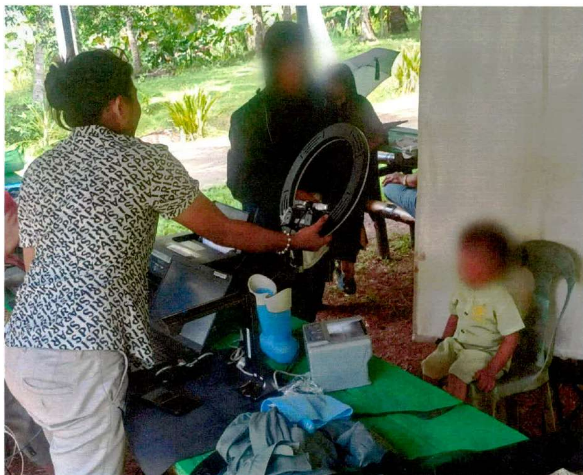
Philippine Statistics Authority IX – National ID registration at Barangay Busay

23 November 2024 – ZAMBOANGA CITY. The Philippine Statistics Authority (PSA) IX has extended its National ID Registration services to the residents of Busay, one of the island barangays in Zamboanga City.