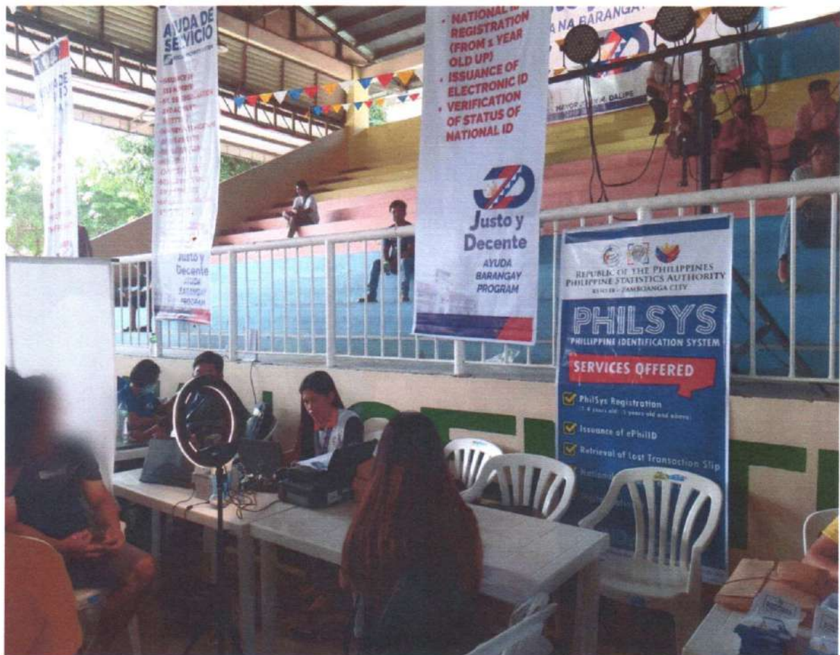
Philippine Statistics Authority (PSA) – National ID during the Just y Desente Program at Barangay Tetuan

20 July 2024 – ZAMBOANGA CITY. The Philippine Statistics Authority (PSA) Regional Statistical Services Office IX joins the service caravan “Justo y Desente Program” organized by the City Government of Zamboanga on the 20 th of July, at Barangay Tetuan Zamboanga City. This one-day initiative aims to deliver various local government programs and