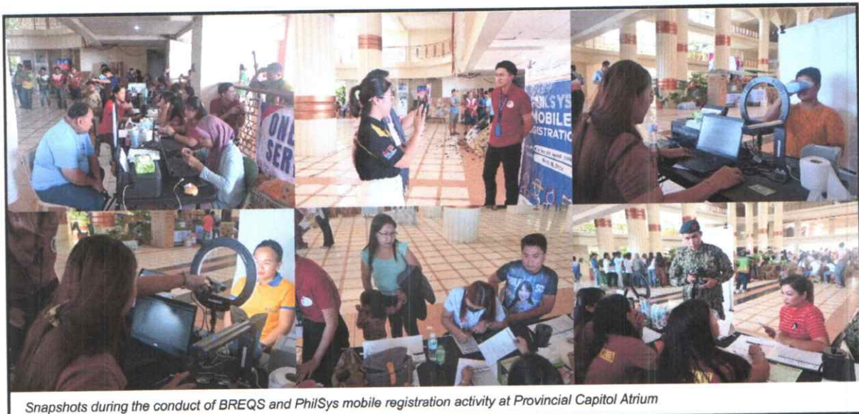
Snapshots during the conduct of BREQS and PhilSys mobile registration activity at Provincial Capitol Atrium

Date of Release: 08 May 2024 Reference No.: 24ZSP-PR20