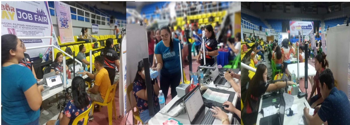
(Above) Actual photos of the ongoing PhilSys registration during the Job Fair and Livelihood Bazaar.

Date of Release: May 2, 2024 Reference No. 2024-PSA-ZDN-011