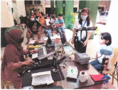
Institutional Registration conducted at Southern City Colleges.

The Philippine Statistics Authority (PSA) Regional Statistical Services Office IX conducted the Philippine Identification System (PhilSys) Institutional Registration, which is an on-site registration activity at Southern City Colleges in Pilar Street, Zamboanga City last 25 June 2022.