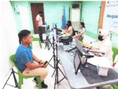
Institutional Registration conducted at People's Micro Finance Cooperative (PMFC)

The Philippine Statistics Authority (PSA) Regional Statistical Services Office IX conducted the Philippine Identification System (PhilSys) Institutional Registration, which is an on-site registration activity at People's Micro Finance Cooperative in Aurora Village, Barangay Guiwan, Zamboanga City last 18 June 2022.