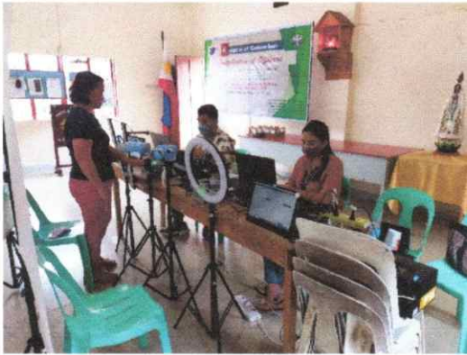
Institutional Registration conducted at Our Lady of Peñafrancia Parish Church

The Philippine Statistics Authority (PSA) Regional Statistical Services Office IX conducted the Philippine Identification System (PhilSys) Institutional Registration, which is an on-site registration activity at Our Lady of Peñafrancia Parish Church located in Southcom Village, Upper Calarian, Zamboanga City last 09 July 2022.