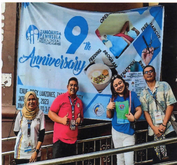
Institutional Registration conducted at Barangay Hall of Lanzones, Zamboanga City

The Philippine Statistics Authority (PSA) Regional Statistical Services Office IX conducted the Philippine Identification System (PhilSys) Registration at Barangay Lanzones in collaboration with Zamboanga Peninsula Medical Center, Inc., last 21 July 2023.