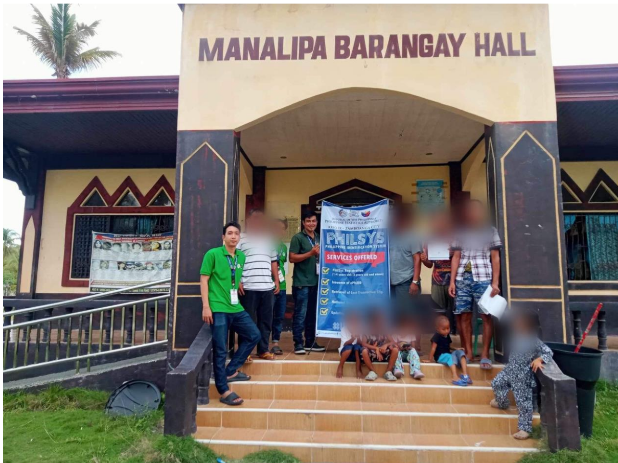
Philippine Statistics Authority IX, conducts PhilSys Registration at Barangay Manalipa, Zamboanga City

Date of Release: 4 June 2024 Reference No. 240900 – 0797C