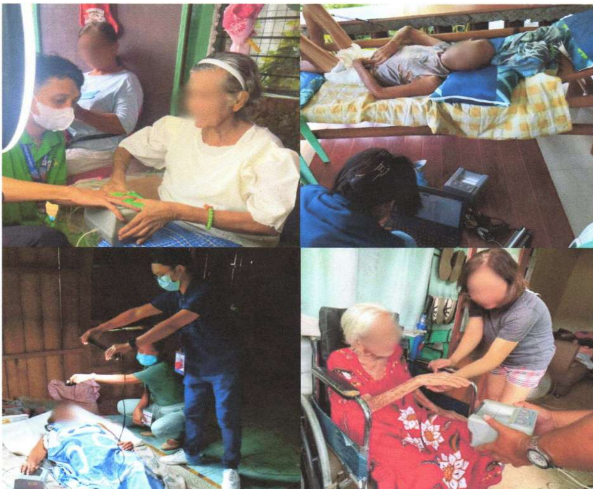
Philippine Statistics Authority IX – National ID Mobile Registration

18 July 2025 – ZAMBOANGA CITY. The Philippine Statistics Authority Regional Statistical Services Office IX organized a special National ID mobile registration activity, specifically for senior citizens and clients who have difficulty walking or traveling. This service was provided to help those