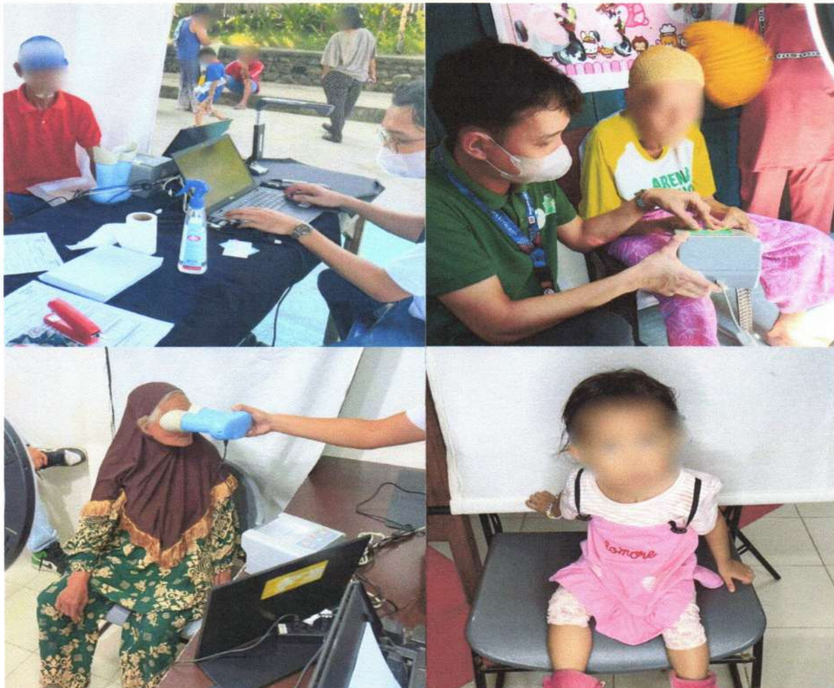
Philippine Statistics Authority IX – National ID Registration and Issuance for July 2025

Date of Release: 31 July 2025 Reference No. 250900–1127B