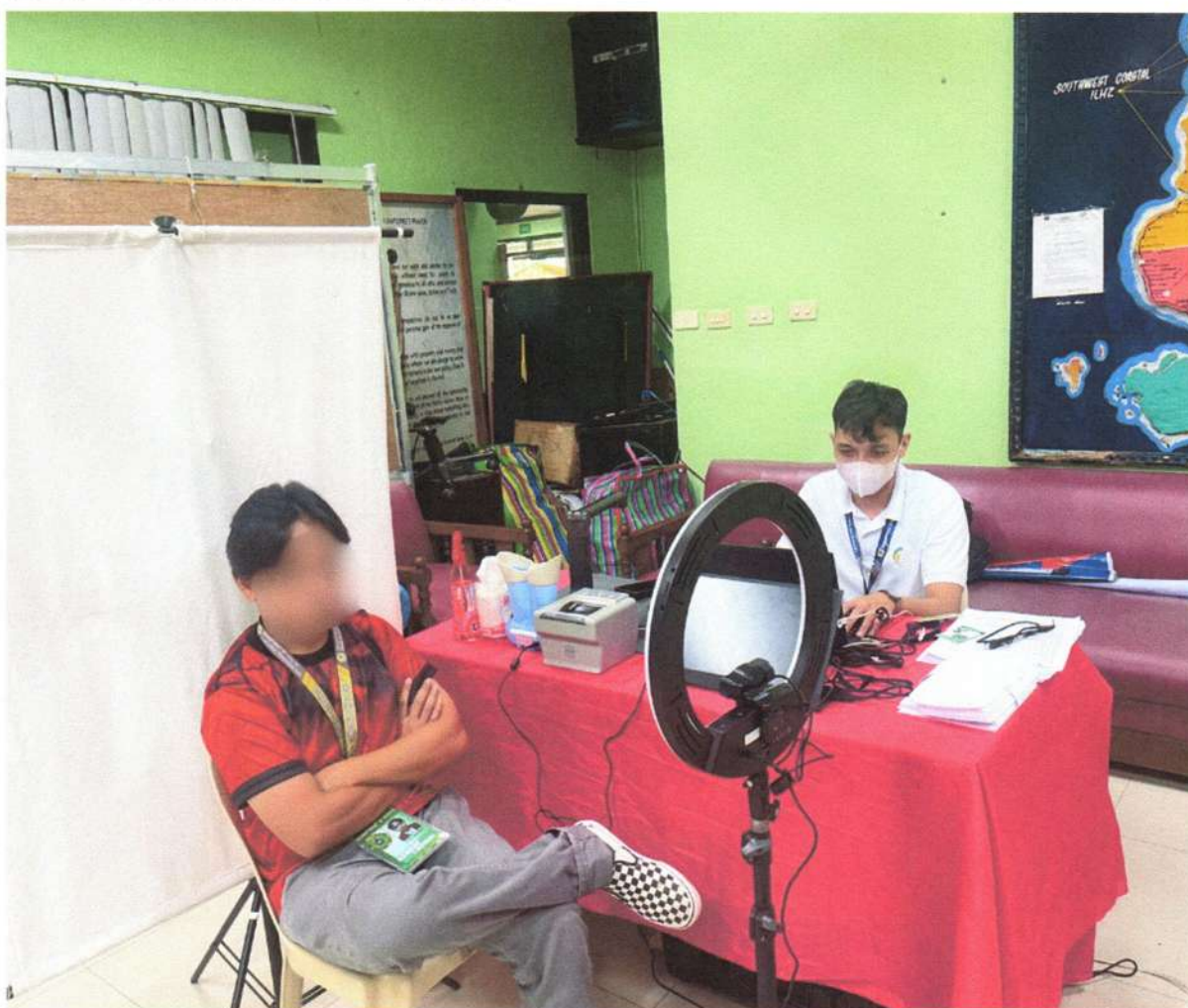
Philippine Statistics Authority IX – National ID Registration at the Department of Health

Date of Release: 31 July 2025 Reference No. 250900–1127A