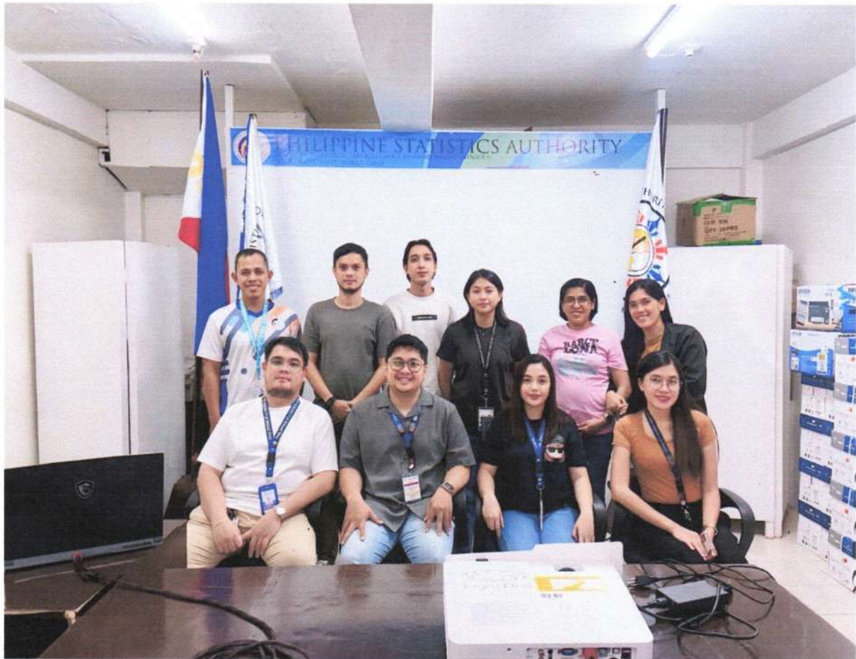
Philippine Statistics Authority IX – Refresher Training at the PSA RSO IX Office

Date of Release: 20 January 2025 Reference No. 240900–0112