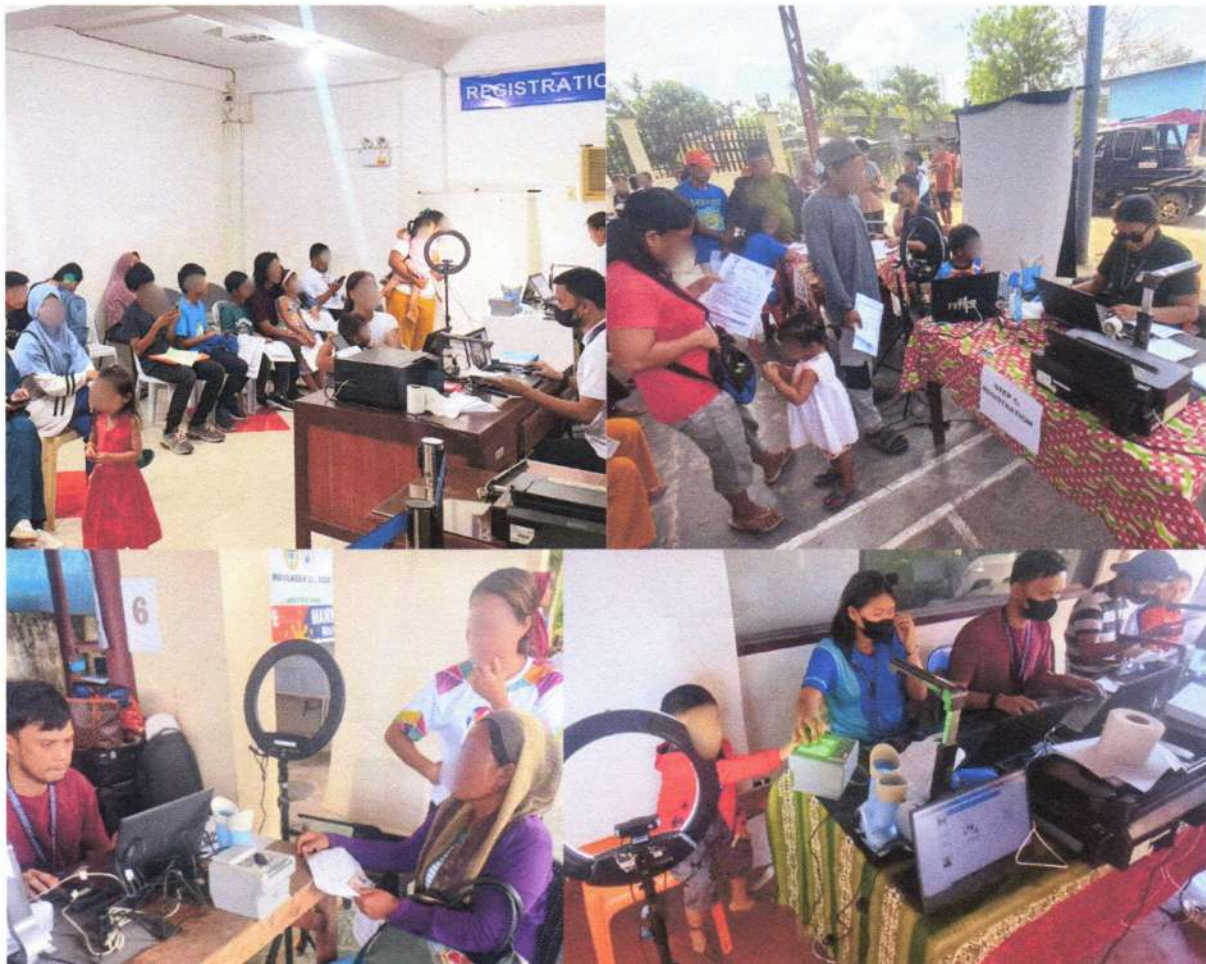
Philippine Statistics Authority IX – National ID registration and Issuance

Date of Release: 28 February 2025 Reference No. 250900-0318