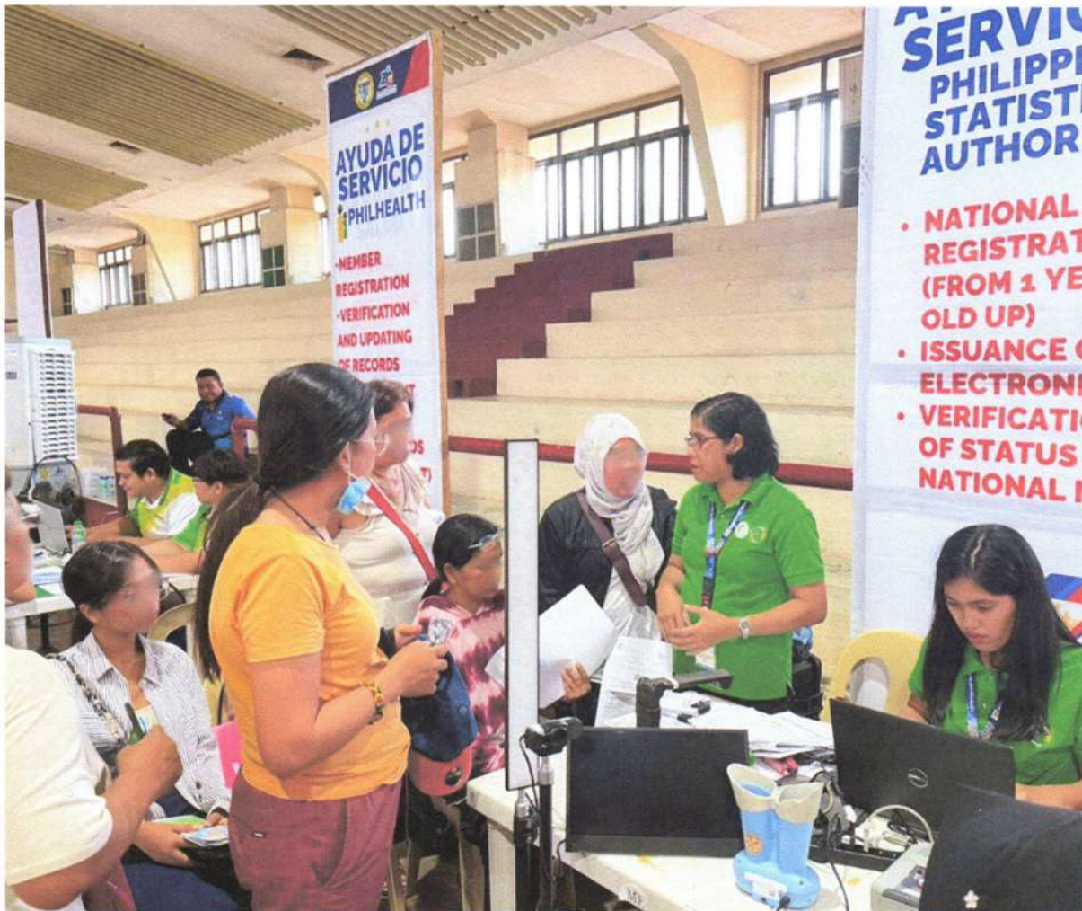
Philippine Statistics Authority IX – National ID registration and issuance at the Western Mindanao State University

Date of Release: 26 February 2025 Reference No. 240900–0300