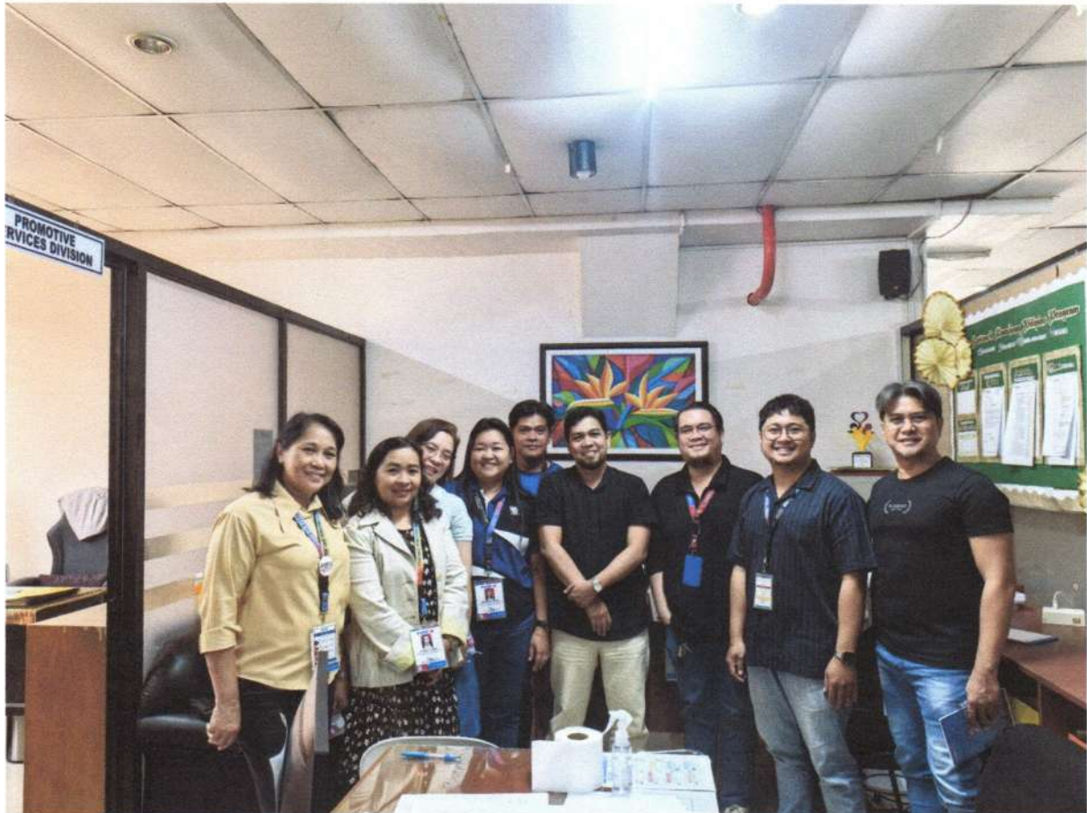
Philippine Statistics Authority IX – PSA RSSO IX and DSWD Regional Office IX Courtesy Meeting