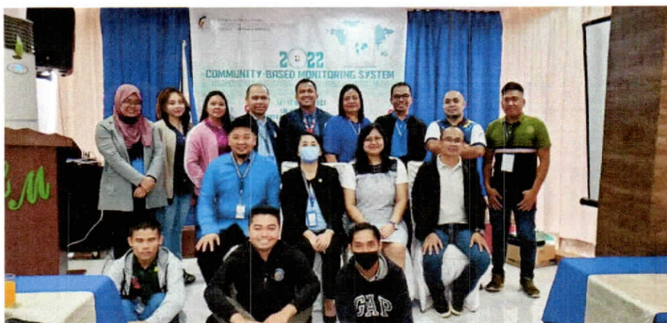
Philippine Statistics Authority -Regional Statistical Service Office IX, facilitated the training on Community-Based Monitoring System (CBMS) on Geotagging of Service on Institutions and Infrastructure, Government Projects and Natural Resources.

The Philippine Statistics Authority - Regional Statistical Service Office IX, conducted a 5-day Regional Level Training (RLT) on Community Based Monitoring System (CBMS) on Geotagging and Processing of Service Institutions and Infrastructure, Government Projects, and Natural Resources (Form 5) to the participants of the Provincial Statistical Offices last 13 to 17 March 2023 at Molave Hall, LM Hotel, Zamboanga City.