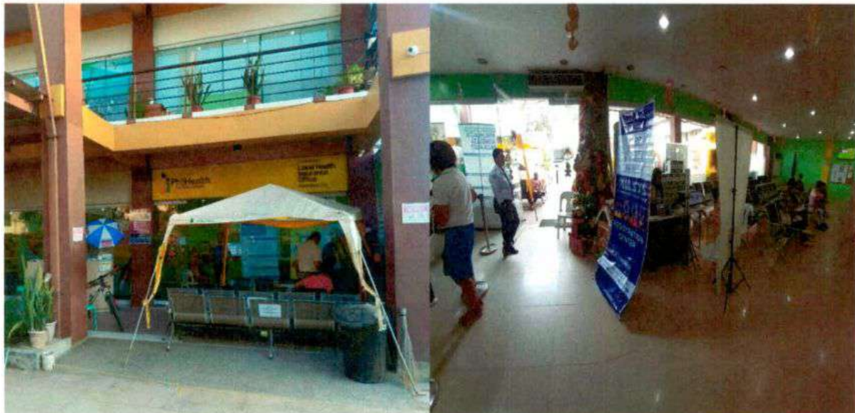
PhilSys Institutional Registration at Zamboanga City PhilHealth Office, Veterans Avenue, Zamboanga City

18 December 2023 – ZAMBOANGA CITY. The Philippine Statistics Authority (PSA) Regional Statistical Services Office IX conducted the Philippine Identification System (PhilSys) institutional registration at Zamboanga City PhilHealth Office.