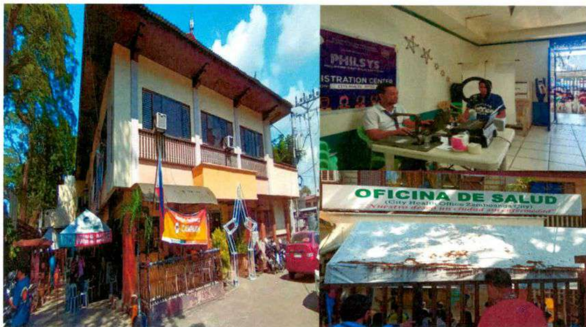
PhilSys Institutional Registration at Zamboanga City Health Office, Pettit Baracks, Barangay Zone IV, Zamboanga City

22 December 2023 – ZAMBOANGA CITY. The Philippine Statistics Authority (PSA) Regional Statistical Services Office IX conducted the Philippine Identification System (PhilSys) institutional registration at Zamboanga City Health Office.