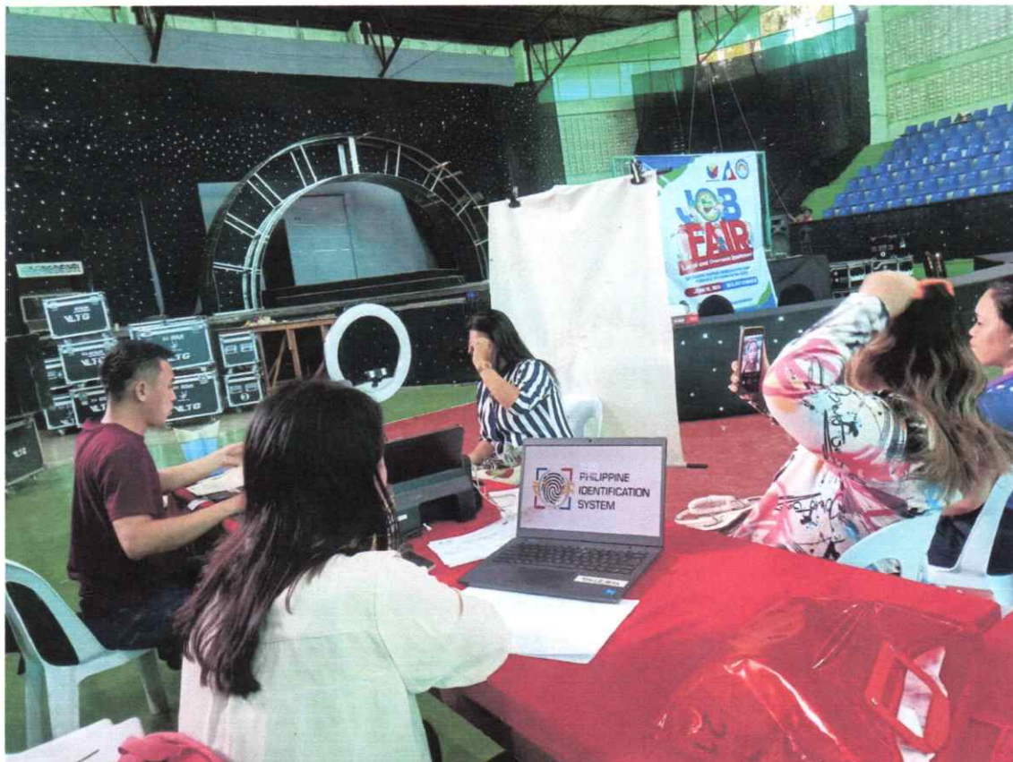
PSA personnel during the conduct of Step 2 Registration in the Municipal Job Fair at the Municipal Gym, Molave, Zamboanga del Sur.

Philippine Statistics Authority Zamboanga del Sur Provincial Statistical Office participated in the Municipal Job Fair in celebration of 76 th Araw ng Molave on 15 June at the Municipal Gymnasium, Molave, Zamboanga del Sur.