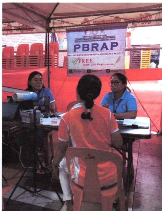
PSA personnel during the conduct of Step 2 Registration in the One Stop Shop Services and Job Fair at the City Covered Court, Pagadian City, Zamboanga del Sur

PSA offered services like Step 2 Registration in Philippine Identification System (PhilSys), assistance in retrieving Transaction Reference Numbers (TRNs) for registered persons who lost their transaction slip, and listing for late registration of Birth Certificate. Both events aim to guarantee convenience and easy-access to government services, especially for first-time job seekers. Other partner agencies also offered services and job opportunities.