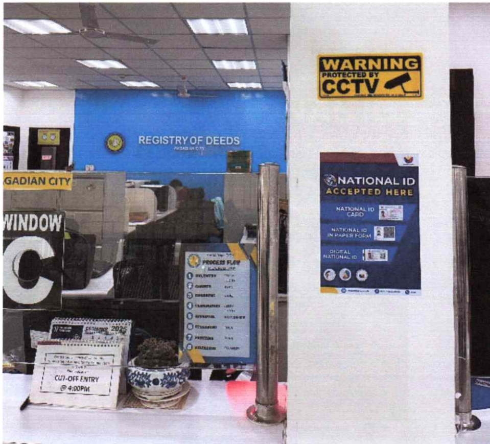
National ID Accepted Here Sticker posted on Registry of Deed's Regional Office, Balintawak, Pagadian City.

For more information, visit us at PSA Zamboanga del Sur Provincial Statistical Office located at 143 V. Sagun St., Balangasan, Pagadian City and email us at psaphilsyszambosur@gmail.com .