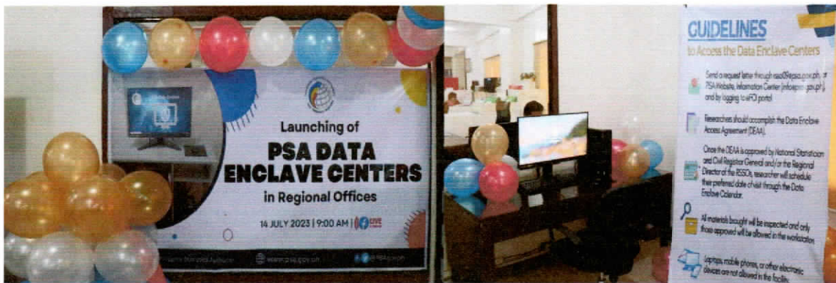
Philippine Statistics Authority - Regional Statistical Services Office IX (PSA-RSSO IX) launched its Data Enclave Center.

14 of July 2023, The Philippine Statistics Authority - Regional Statistical Services Office IX (PSA-RSSO IX) held the launching of the Data Enclave Center in the region simultaneously with the other 17 regional offices in a hybrid setup. The Philippine Statistics Authority is the central statistical data authority of the Philippine government on primary data collection. The agency is committed to deliver relevant and reliable data in a secured system for the academe, partners and stakeholders.