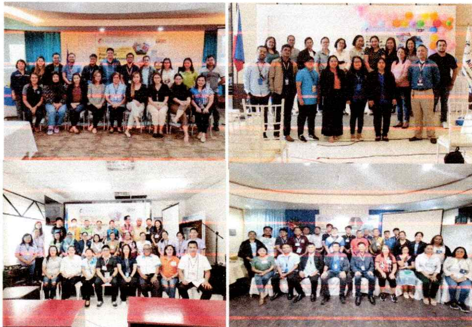
Philippine Statistics Authority Central Office, together with Philippine Statistics Authority Region IX, facilitated the Briefing – Workshop of Provincial Product Accounts (PPA) at vital locations in Zamboanga Peninsula. Zamboanga city (top left), Zamboanga del Norte (top right), Zamboanga del Sur (bottom left), Zamboanga Sibugay (bottom right).

The Philippine Statistics Authority (PSA) Central Office, in collaboration with the Philippine Statistics Authority Region IX, conducted a 2-day Briefing-Workshop to the Stakeholders Towards the Compilation of the Provincial Product Accounts from both local and national government line agencies in various venues in Zamboanga Peninsula last 02 to 03 March 2023.