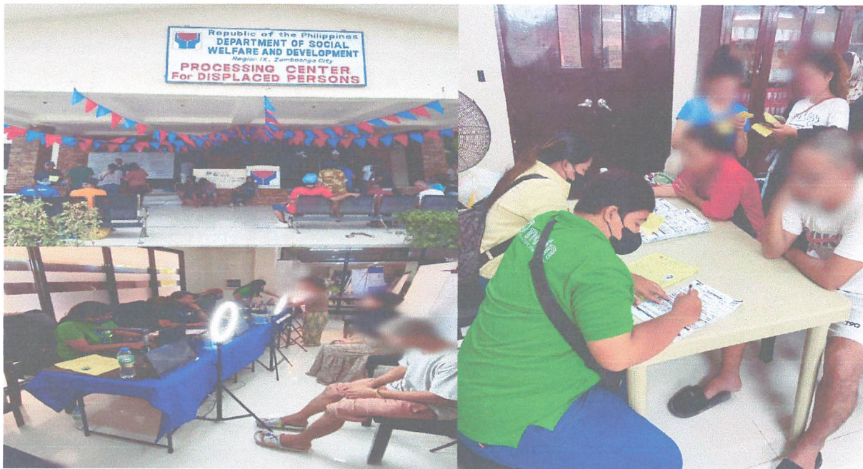
PhilSys Colocation Registration at DSWD-PCDP Facility, Brgy. Talon- Talon, Zamboanga City

Date of Release: 29 January 2024 Reference No. 240900 – 0116D