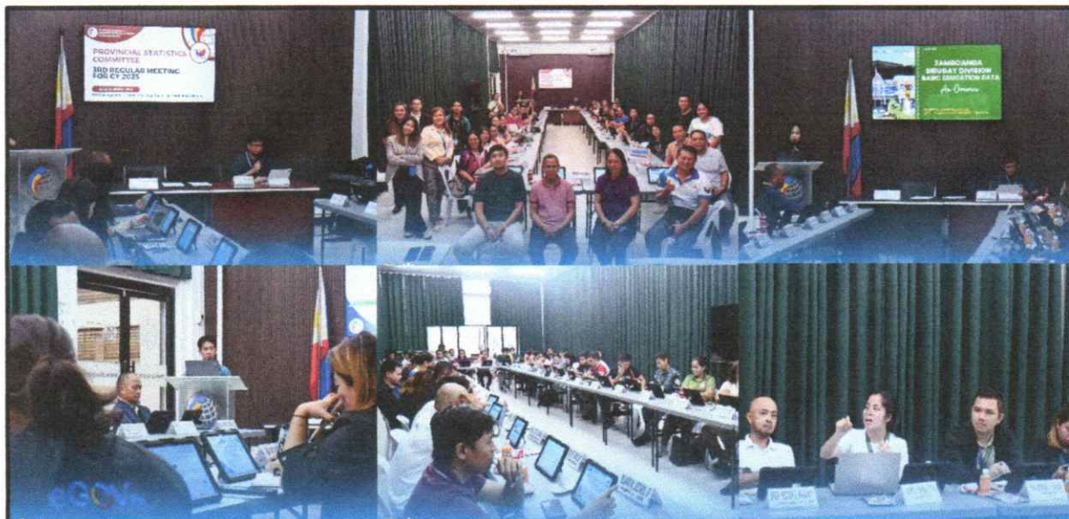
Highlights in Photos: Third Quarter PSC Meeting for Calendar Year 2025

IPIL, ZAMBOANGA SIBUGAY — Members and representatives of the Zamboanga Sibugay Provincial Statistics Committee (PSC) came together once again for their third regular meeting on 25 July 2025, held at the PSA Training Room, YOHO Center in Sanito, Ipil, Zamboanga Sibugay.