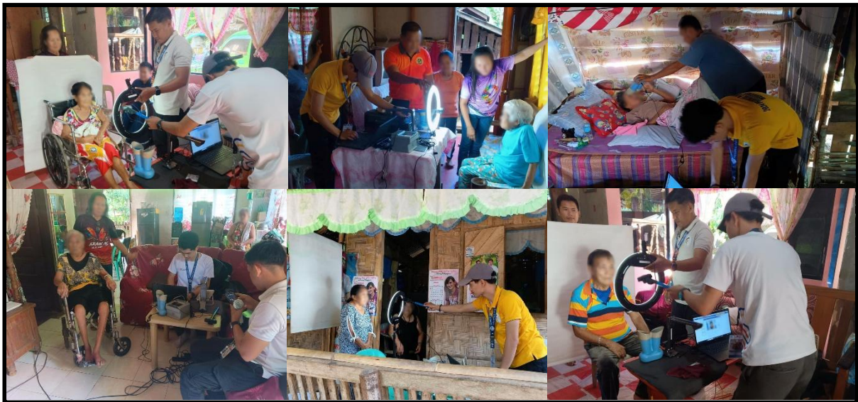
Snapshots during the conduct of barangay-based and house-to-house National ID mobile registration

24 June 2025 – Ipil, Zamboanga Sibugay. The Philippine Statistics Authority (PSA) – Zamboanga Sibugay continues to bring essential services closer to the people through its ongoing mobile registration for the National Identification (NID) System, with a particular focus on senior citizens and individuals with limited mobility.