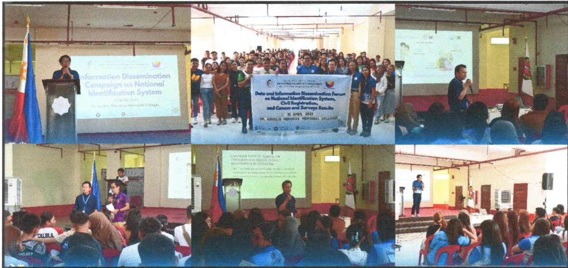
Snapshots during the conduct of Data and Information Dissemination Forum at Dr. Aurelio Mendoza Memorial Colleges – Ipil, ZSP

The Philippine Statistics Authority – Zamboanga Sibugay held a Data and Information Dissemination Forum on 14 April 2025 at Dr. Aurelio Mendoza Memorial Colleges (AMMC) – Ipil, Zamboanga Sibugay. Over 250 students, faculty, and staff from AMMC attended the event, which aimed to raise awareness and provide better understanding of the National ID system, its role in improving public service delivery, and Civil Registration and Vital Statistics (CRVS). The forum also highlighted the services available through the Civil Registry System (CRS) Ipil Outlet.