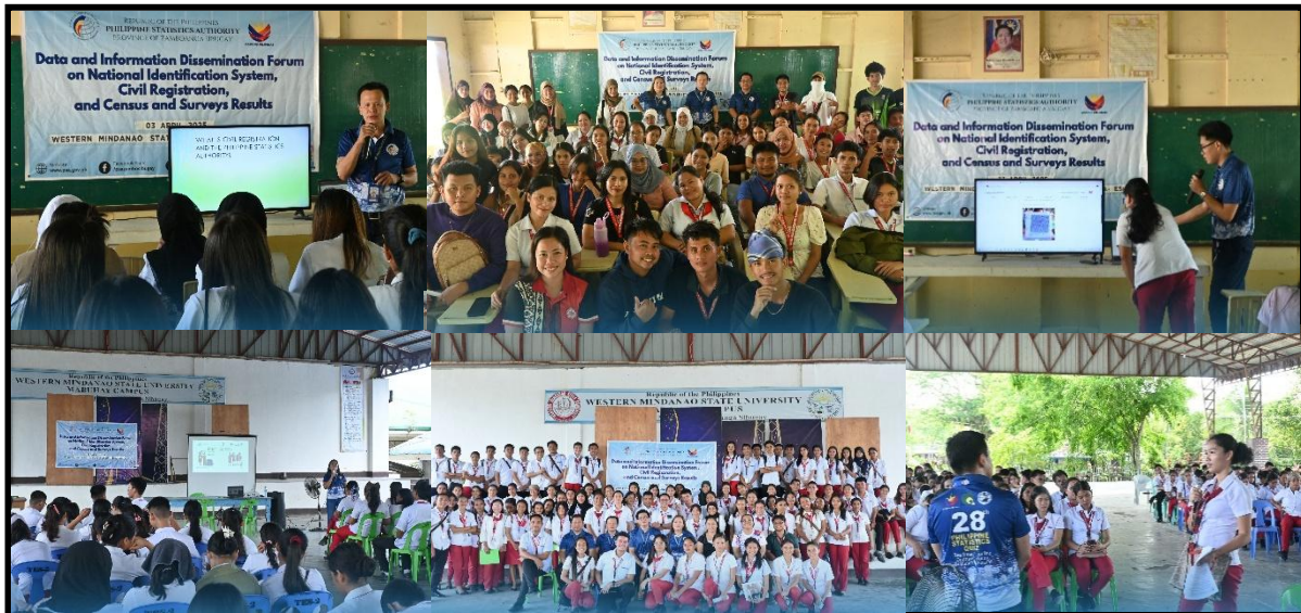
Snapshots during the conduct of Data and Information Dissemination Forum at WMSU – Olutanga ESU and WMSU – Mabuhay ESU

The Philippine Statistics Authority (PSA) – Zamboanga Sibugay successfully spearheaded a Data and Information Dissemination Forum on 03 April 2025. The event took place at Western Mindanao State University – Olutanga ESU in the morning and Western Mindanao State University – Mabuhay ESU in the afternoon, drawing over 100 participants, including students, faculty, and staff.