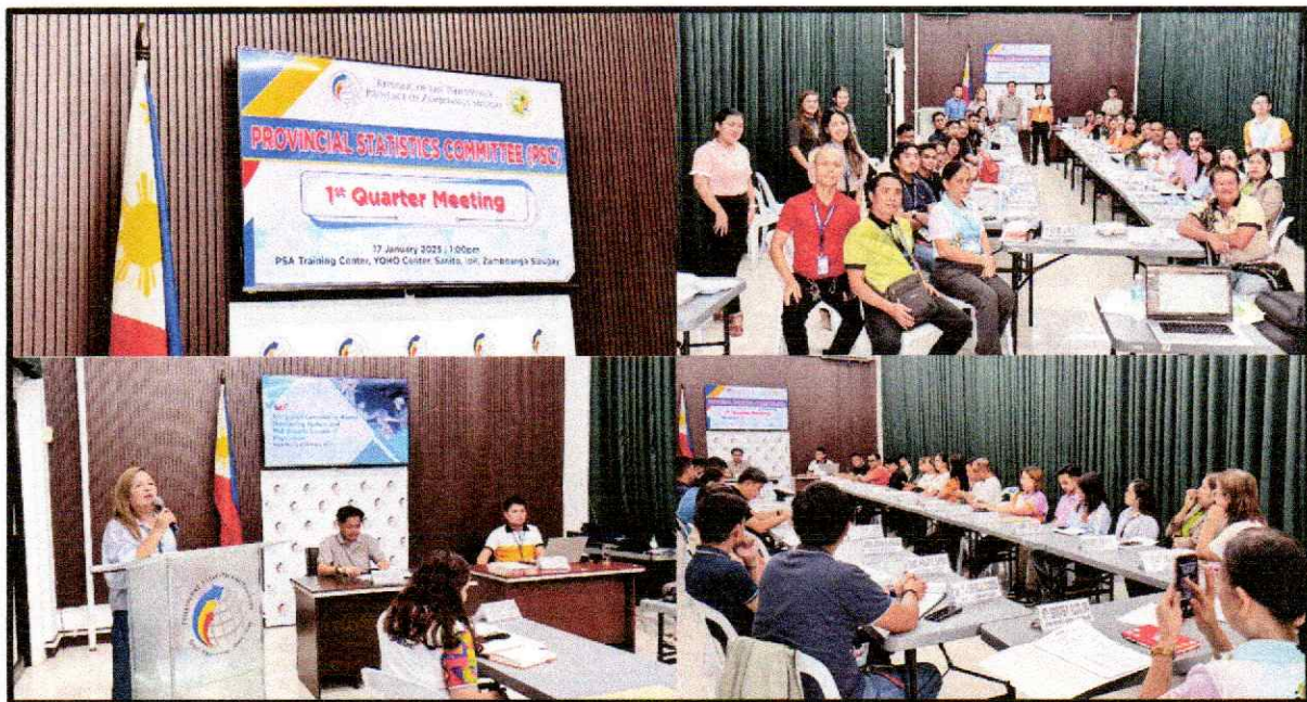
Snapshots during the First Quarter Provincial Statistics Committee meeting for CY 2025