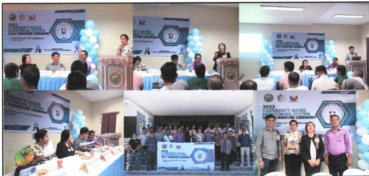
Snapshots during the 2022 CBMS Data Turnover Ceremony in Mabuhay

The Philippine Statistics Authority (PSA) - Zamboanga Sibugay had successfully handed over the 2022 Community-Based Monitoring System (CBMS) Data of the Local Government Unit (LGU) of Mabuhay through the conduct of the Data Turnover Ceremony (DTC) in the said municipality.