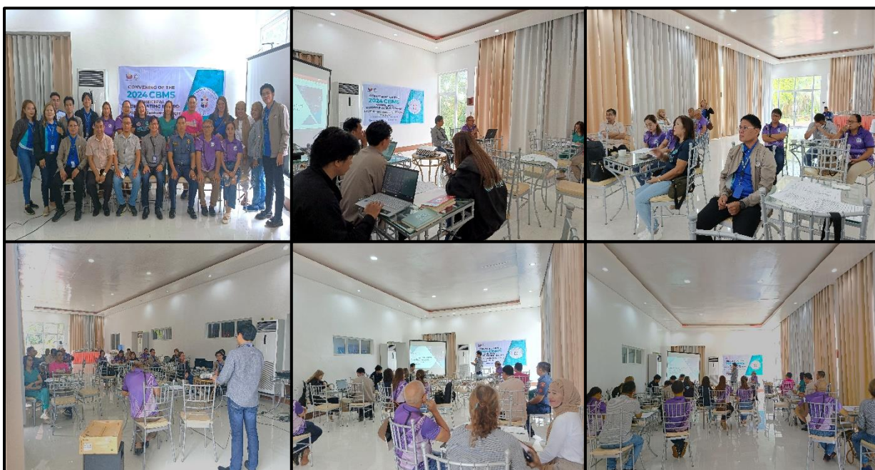
Snapshots during the convening of the 2024 Municipal CBMS Coordinating Board