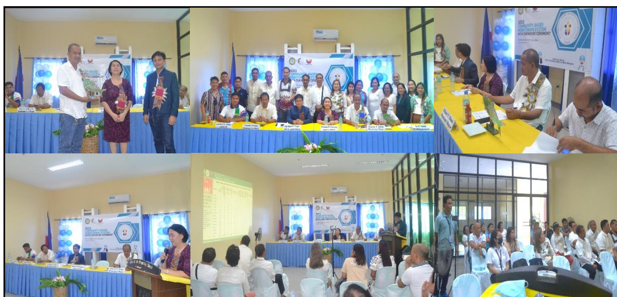
Snapshots during the 2022 CBMS Data Turnover Ceremony in Talusan

The Philippine Statistics Authority (PSA) Zamboanga Sibugay Provincial Office proudly culminates the successful implementation of the first ever PSA-Funded 2022 Community-Based Monitoring System (CBMS) in the Province of Zamboanga Sibugay through the conduct of Data Turnover Ceremony (DTC) at Talusan, Zamboanga Sibugay.