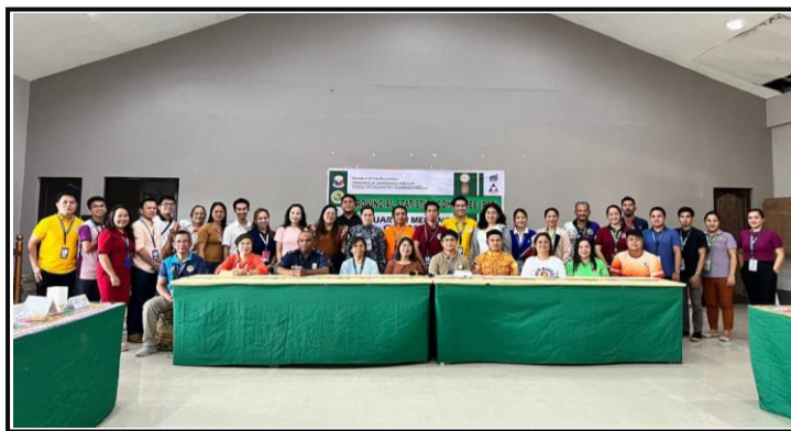
Group photo of PSC Members together with PSC-Vice Chairperson, Atty. Tabigne

Date of Release: 15 January 2024 Reference No.: 24ZSP – PR02