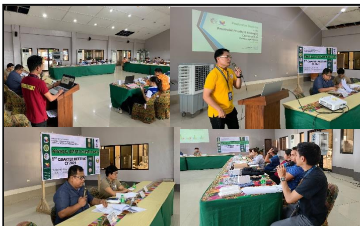
Snapshots during the PSC 1 st Quarter Meeting C.Y. 2024