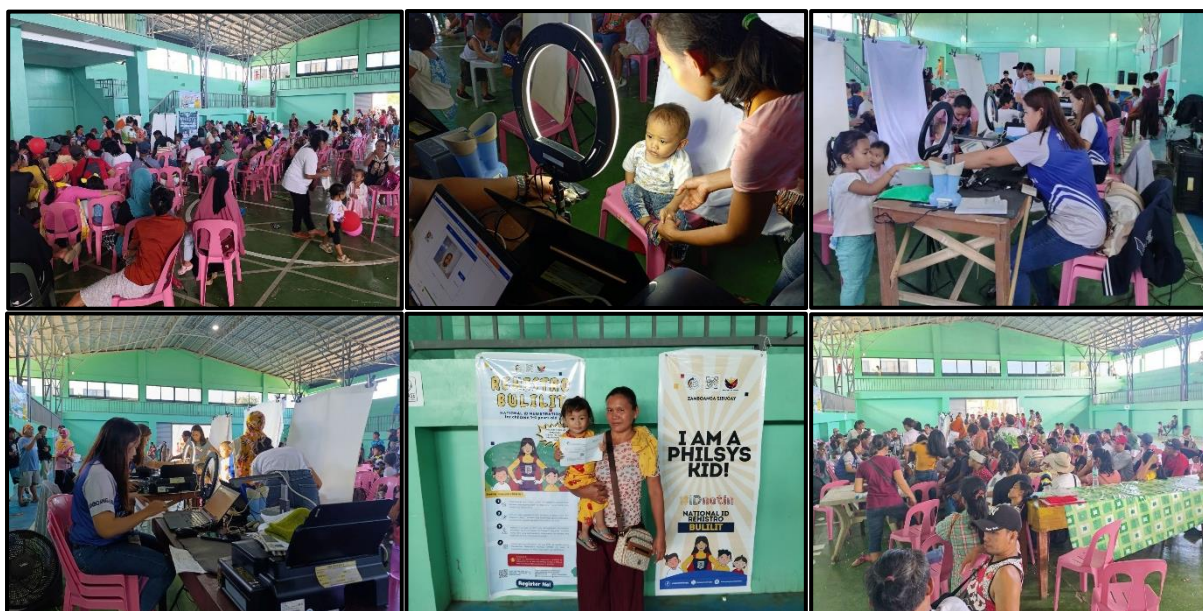
Snapshots during the conduct of “Rehistro Bulilit” Campaign in Poblacion, Payao, ZSP

On 27 September 2024, the PSA – Zamboanga Sibugay successfully conducted the “Rehistro Bulilit” campaign at the Payao Municipal Covered Court, Poblacion, Payao, ZSP. This initiative is part of the PSO - Zamboanga Sibugay National ID team’s continuous efforts in ensuring the saturation of unregistered individuals in the province, particularly children aged one (1) to four (4) years old.