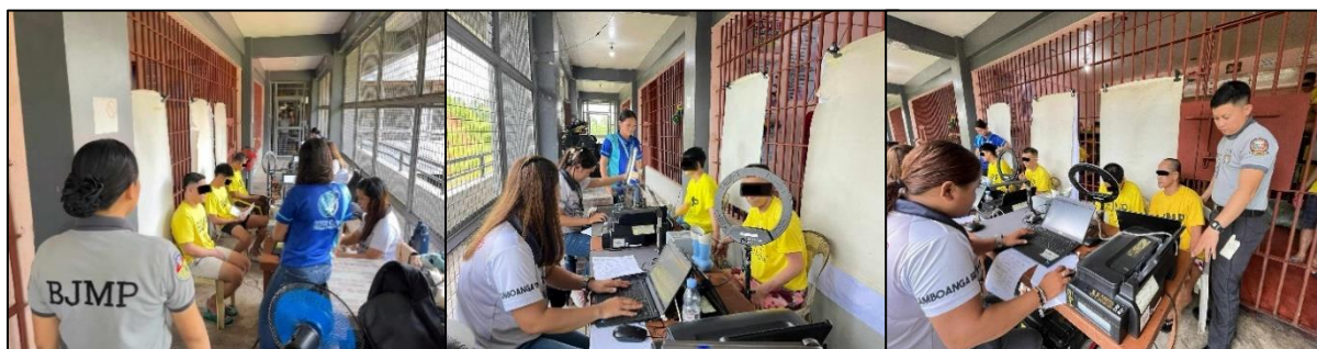
Snapshots during the on-site National ID Registration at BJMP, Imelda, ZSP

Date of Release: 27 September 2024 Reference No.: 2483-PR33