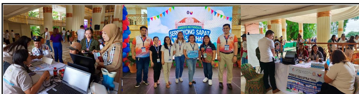
Snapshots during the conduct of BREQS and National ID mobile registration activity at Provincial Capitol, Ipil, ZSP

The Philippine Statistics Authority – Zamboanga Sibugay offered National ID registration services and processed requests for civil registry documents through the One-Stop-Shop Services during the simultaneous nationwide ‘Araw ng Pangulo: Handog ng Pangulo Serbisyon Sapad Para sa Lahat’ event. It was spearheaded by the Department of Labor and Employment – Zamboanga Sibugay Field Office (DOLE-ZSFO) on 13 September 2024 held at Provincial Capitol, Ipil Heights, Ipil, Zamboanga Sibugay.