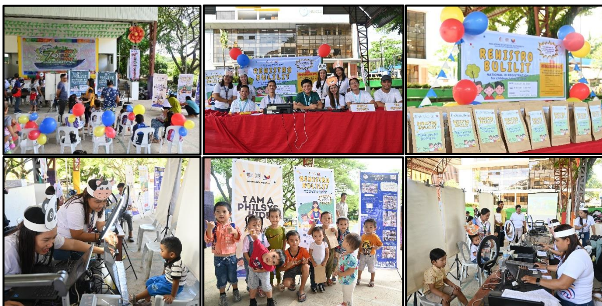
Snapshots during the launching of “Rehistro Bulilit” Campaign in Poblacion, Alicia, ZSP

As part of the ongoing effort to register more Filipinos in the National Identification System, the PhilSys Team of Zamboanga Sibugay continues to focus on reaching unregistered individuals, particularly children aged one (1) to four (4) years old. On 28 August 2024, the PSA – Zamboanga Sibugay launched the “Rehistro Bulilit” campaign at the Municipal Covered Court in Poblacion, Alicia, Zamboanga Sibugay. The campaign aimed to bring PSA’s services closer to this young, unregistered population and encourage parents and guardians to register their children for the National ID System.