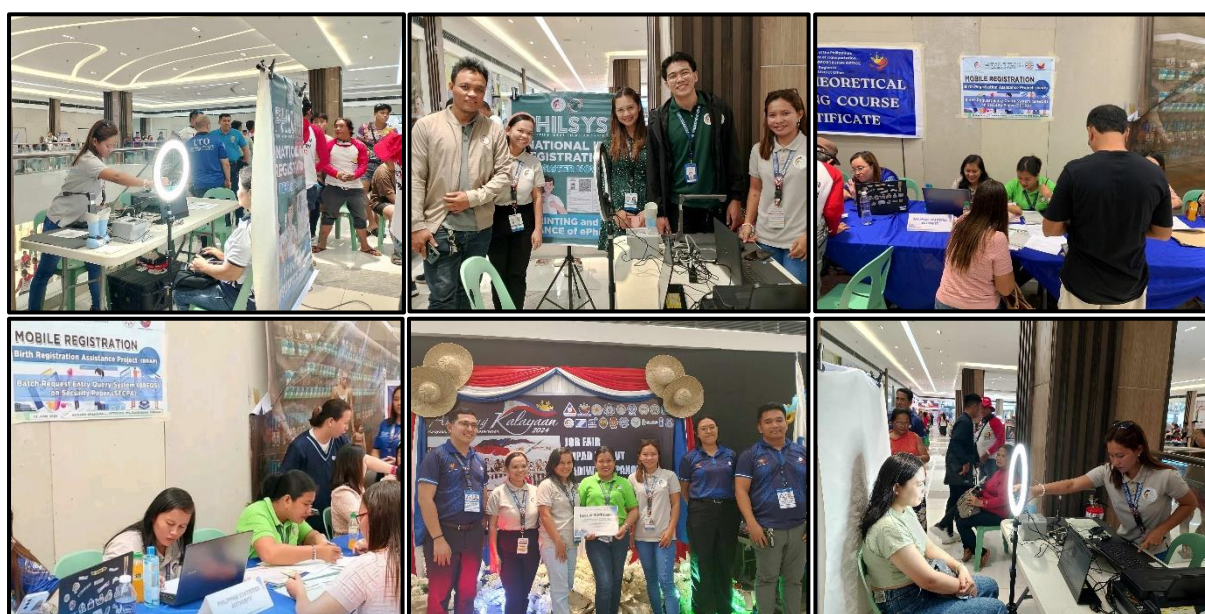
Snapshots during the 126 th Araw ng Kalayaan One-Stop Services at Gaisano Grand Mall, Ipil, ZSP

The Philippine Statistics Authority – Zamboanga Sibugay proudly participated in the One-Stop Shop services initiated by the Department of Labor and Employment – Zamboanga Sibugay Field Office (DOLE-ZSFO) in celebration of the 126 th Araw ng Kalayaan held at Gaisano Grand Mall, Ipil, Zamboanga Sibugay, on 12 June 2024, bringing valuable services and information to the local community.