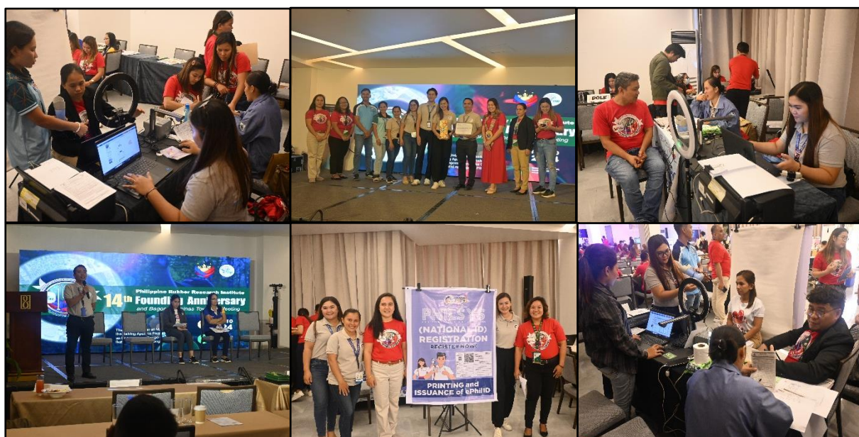
Snapshots during the PRRI 14 th Founding Anniversary Serbisyo Caravan at Badsbrotel Suites, Ipil, ZSP

The Philippine Statistics Authority – Zamboanga Sibugay offered Philippine Identification (PhilID) or national ID registration services and processed requests for civil registry documents during the Serbisyo Caravan initiated by the Philippine Rubber Research Institute (PRRI). This event was part of the celebration of the PRRI's 14 th Founding Anniversary on 10 May 2024 at Emerald Hall, Badsbrotel Suites, Ipil, Zamboanga Sibugay.